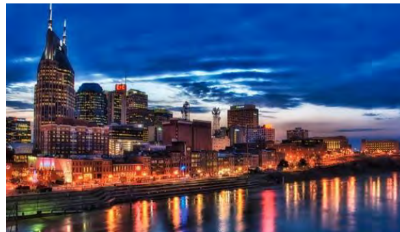
Nashville Study Away Program Nashville, TN