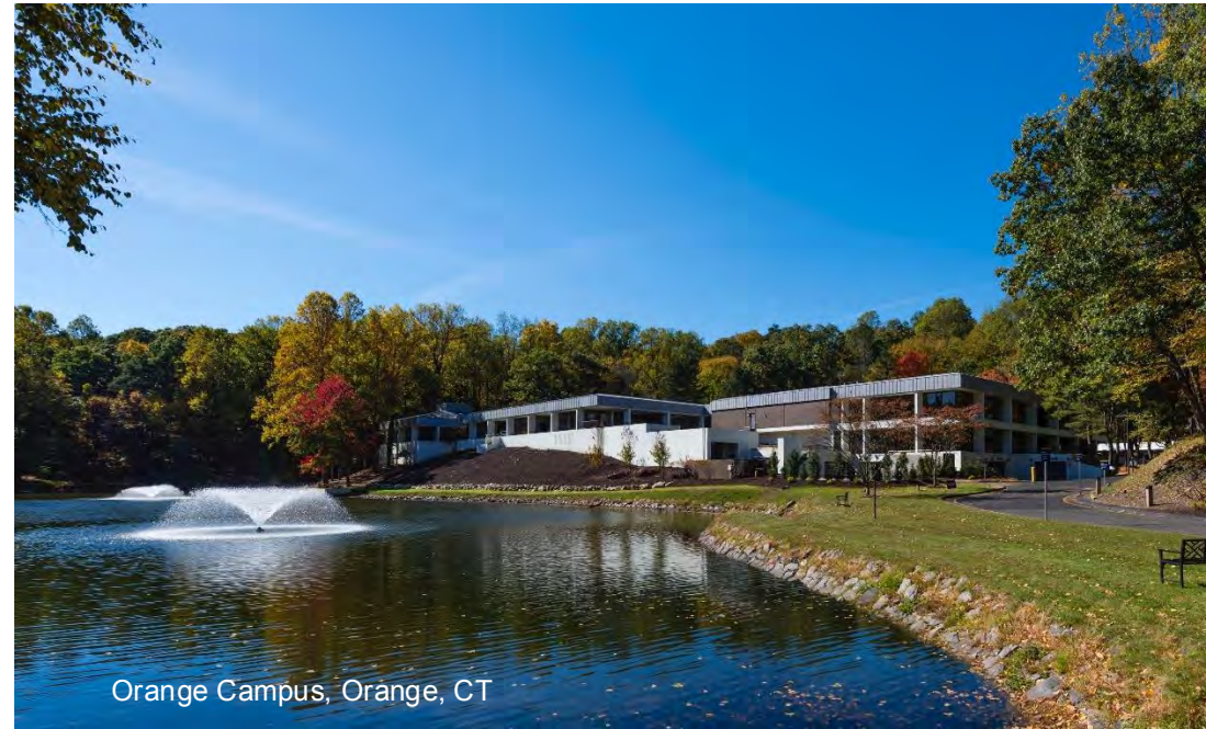
Orange Campus, Orange, CT

We have partnered with local, state, and federal agencies in an effort to enhance our students safety while traveling abroad.