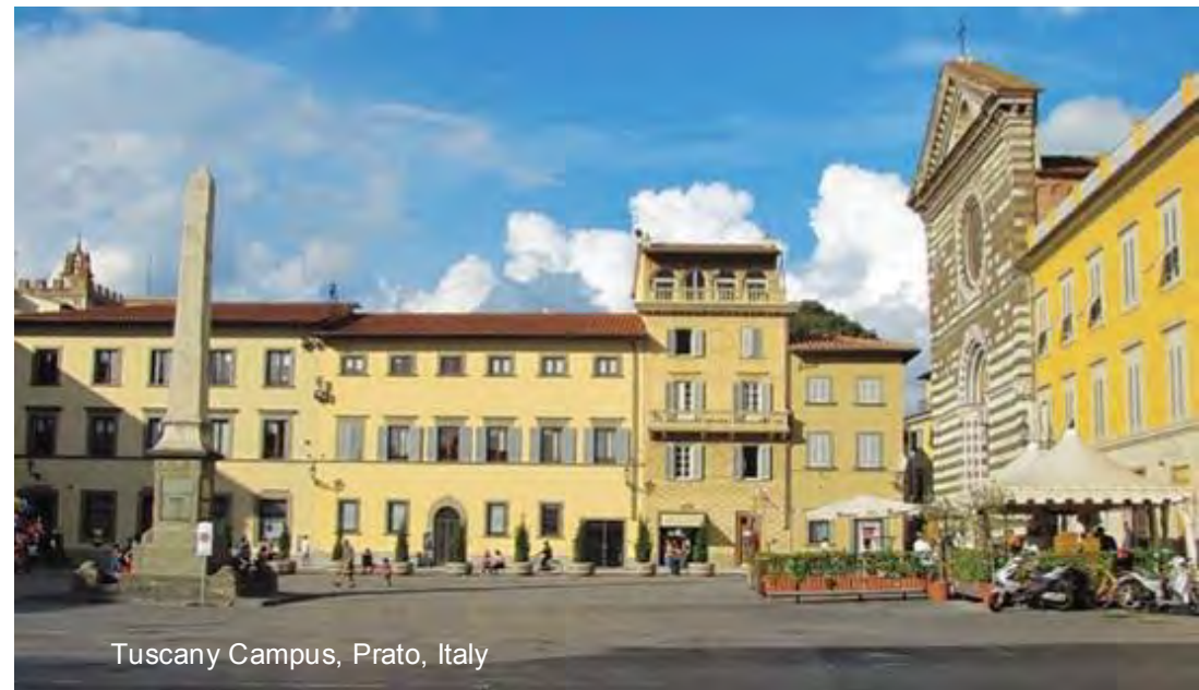
Tuscany Campus, Prato, Italy