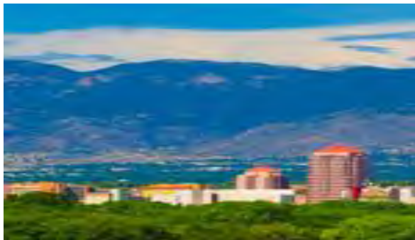
National Security Program Kirtland Air Force Base, Albuquerque, NM